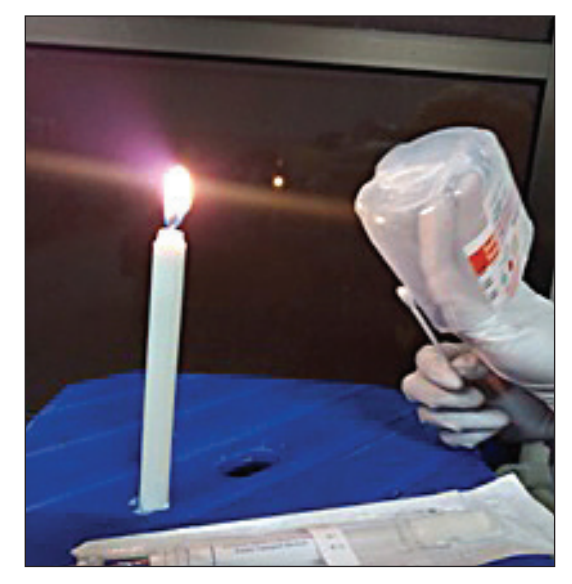
Figure 1. Aseptic technique during the swabbing process of used spike infusion