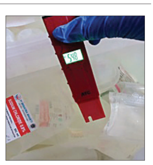
Figure 2. Measurement of temperature and Ph during the medical waste recycling process