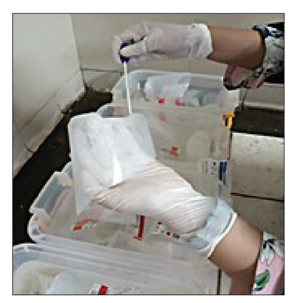
Figure 3. Used spike infusion swabbing process