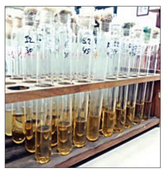
Figure 4. Bacterial culture/microbial isolation from samples of recyclable medical waste

22.8–26.6°C. Changes in temperature at any time in the reactor can be affected due to changes in air temperature around the research area. According to Soebagio (2011) in Handayani and Sugeng (2015), states that the higher water temperature can increase the effectiveness of chlorine for disinfection. This condition also affects the amount of chlorine for disinfection, when the water temperature decreases, the use of required chlorine increases the use of chlorine increases the use of chlorine is relatively less.